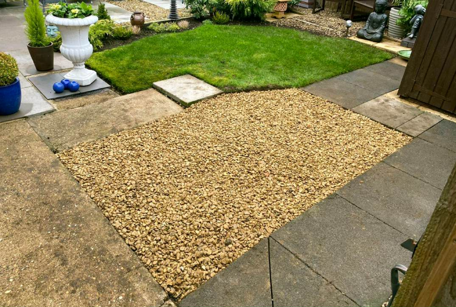
Weeding to general maintenance