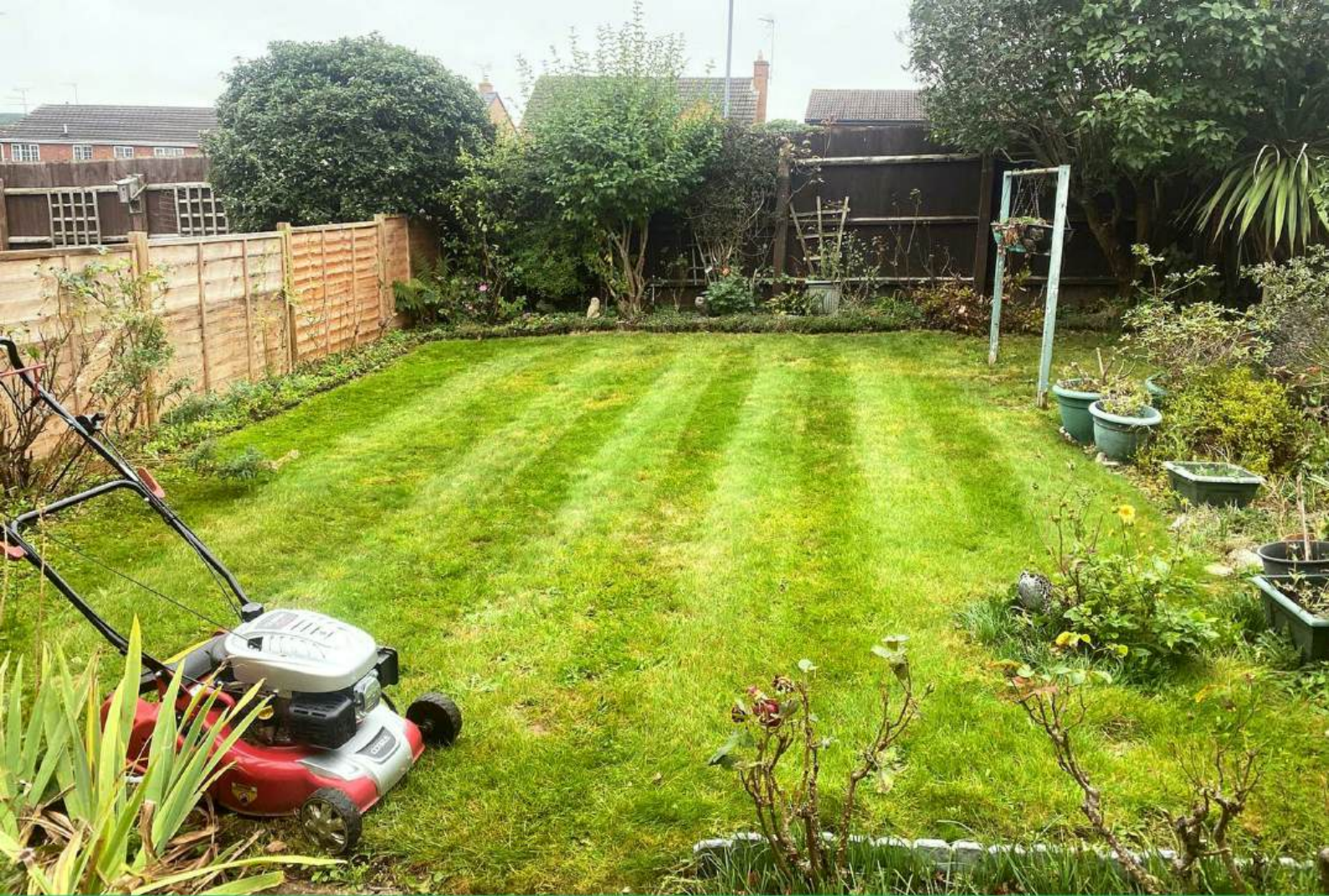
Lawn mowing to hedge cutting